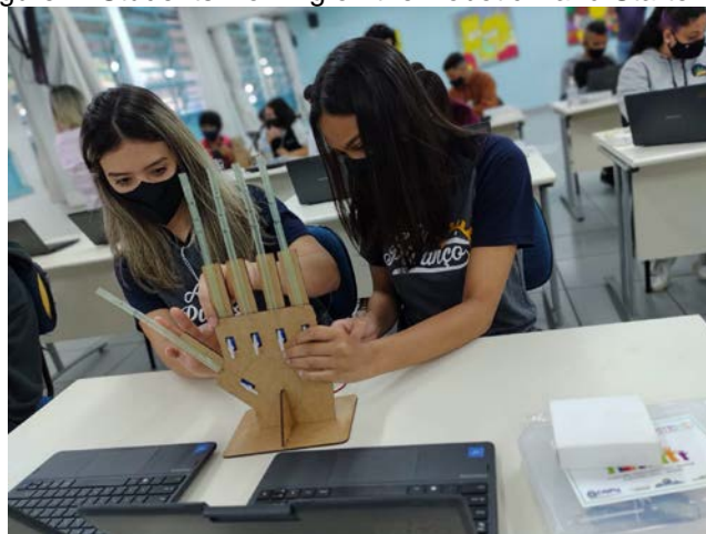
Figure 2: Students working on the Robotic Hand Starter Kit.

During the classes we offered some theoretical concepts and developed a part of the project. The workshop was offered inside the Math classes and students were able to choose whether they wanted to participate, or not. We used the digital resource room, a room with computers and enough space to receive 20 students, maintaining the number of people per square meter indicated by candle surveillance measures to contain COVID-19. Students and teachers wore masks during the activities. The students were grouped in pairs to execute the hand-on activities, this choice was made thinking in the distance measures, in other contexts of the disease we believe that the groups could be of three or four students, allowing to apply the workshop to a greater number of students. Figure 2 shows the workshop application.